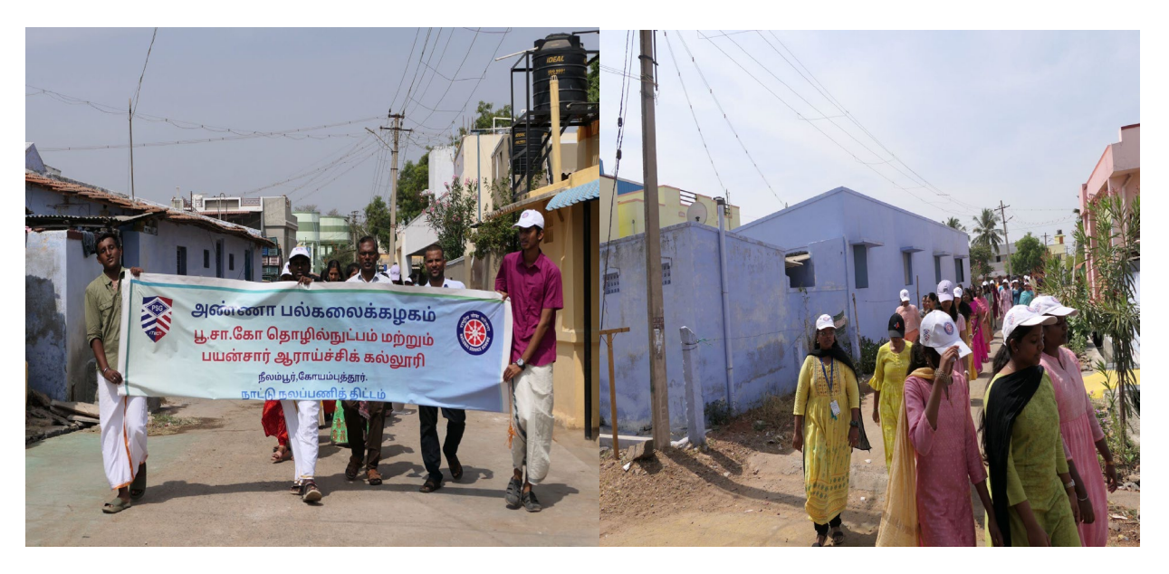
Rally for Awareness about election and plastics

Volunteers were colorfully dressed with traditionals. Around 9:30 am students went for a rally in the village streets for the "Awareness for election" and "Awareness about Plastics and proper waste disposal".