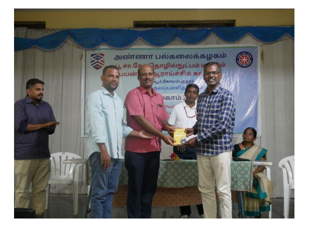
Evening Function for the Volunteers

(MC) performance setting the stage for a memorable evening. The highlight of the evening was a captivating drama, song, dance performance by the volunteers.