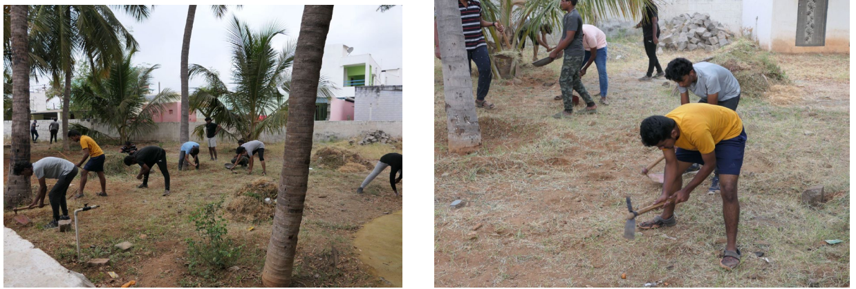
Field work on the premises of the temple

During the morning field session, the Students started cleaning the temple premises in Kurumbapalayam.