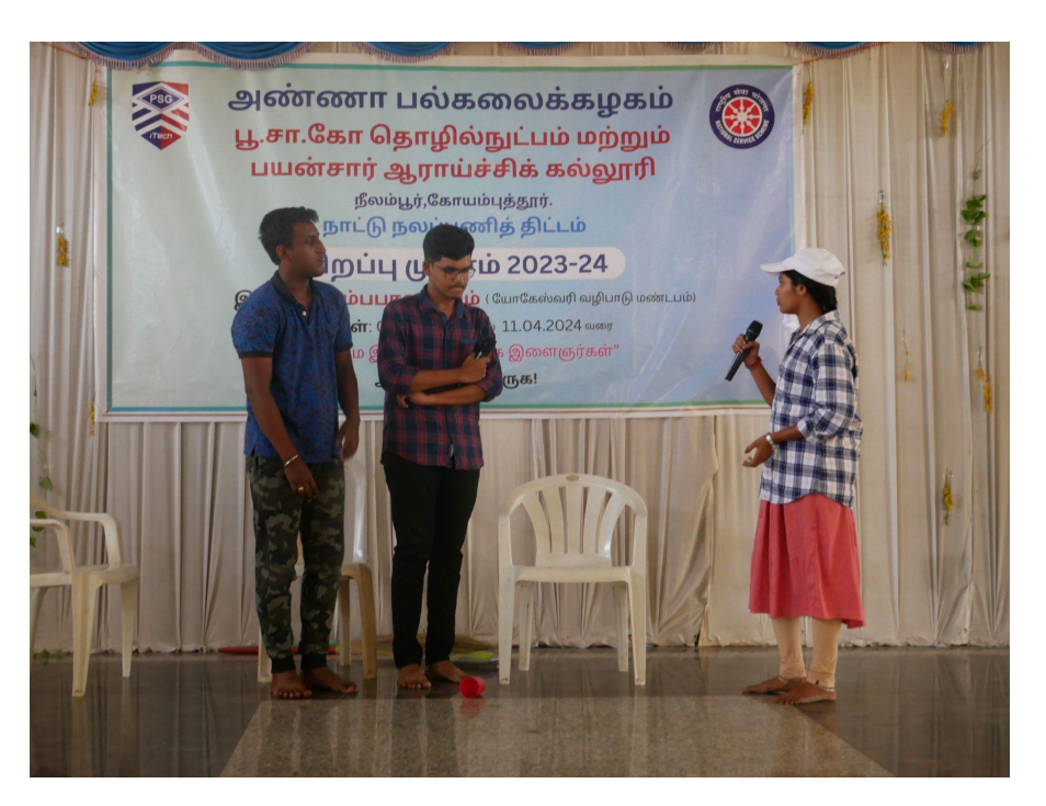
Drama performed by Students

At the end of the day, the students had shared our experience, and also received comments from all the team leads.