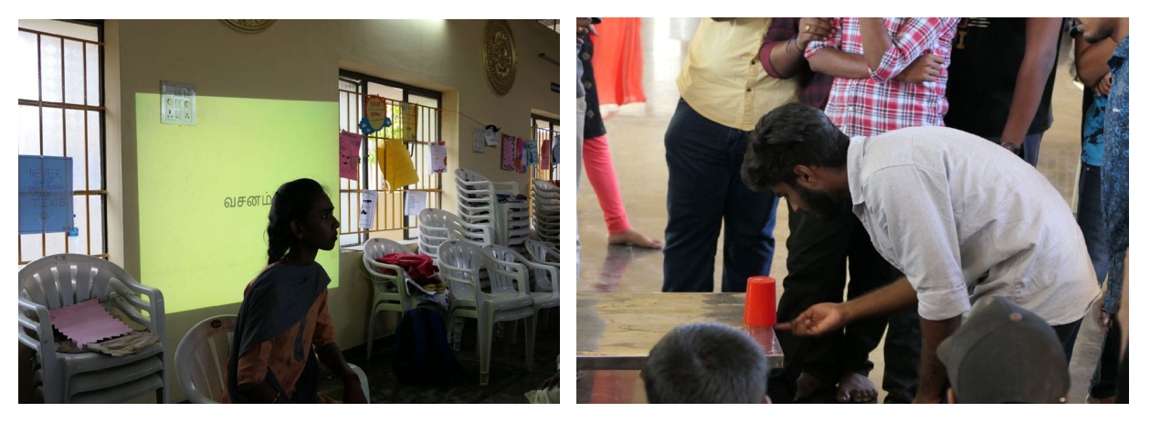
Management games conducted for the volunteers

Rally for "Awareness for election" and Survey in Muthalipalayam Management games were conducted for volunteers to encourage team spirit among the teams.