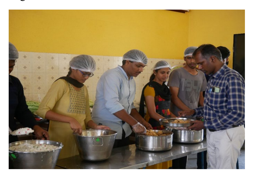
Students serving the food them made

At noon, the lunch was prepared by the students and they had experience in both cooking and serving.