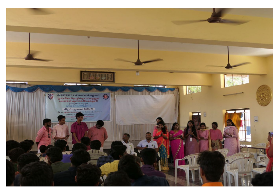
Team wise students and leads were giving their feedback

At 3:00 am all teams were asked to share their experience and the feedback. Nss officers and Team leads gave feedback on each individual volunteer. Also sheets were passed among all, and each of them were told to write feedback about each individual member.