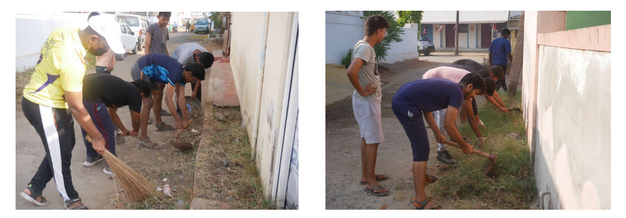
Students doing field work

During the morning field session, the Students started cleaning the street in Kurumbapalayam.